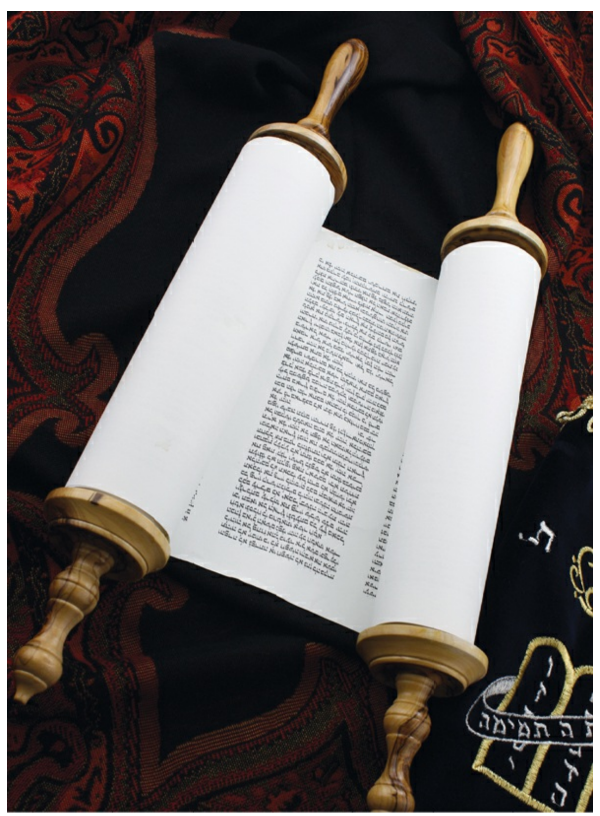
The Torah. The Torah, consisting of the five books of Moses, in a broader sense encompasses the entire range of Jewish thought and teachings.